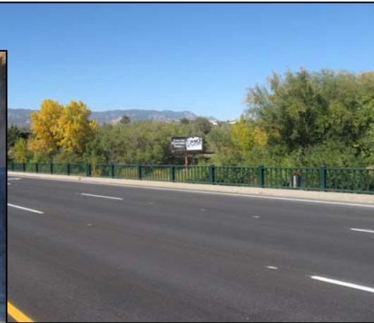
Right: refurbished guardrail completed on north bridge rail.