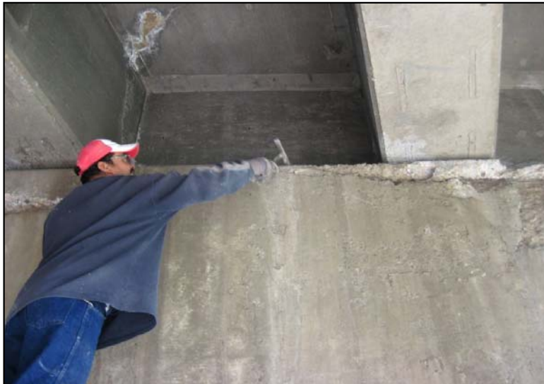
Concrete repairs in progress on the structural supports of the bridge