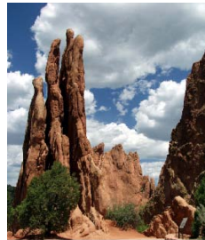
Three Graces at Garden of the Gods