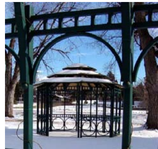
Heritage Gazebo at Monument Valley Park

American Mother's Chapel at RLR: $200 3130 North 30th Street; 80904 Maximum Capacity: 15 Seats; 12 in chapel