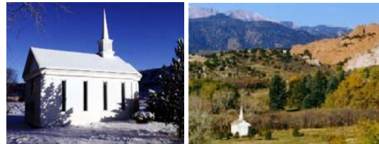
American Mother's Chapel at Rock Ledge Ranch